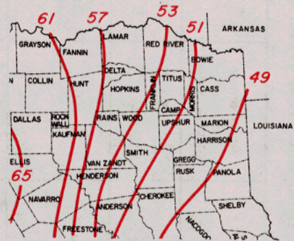
Average Annual Gross Lake Surface Evaporation (Inches) 2/