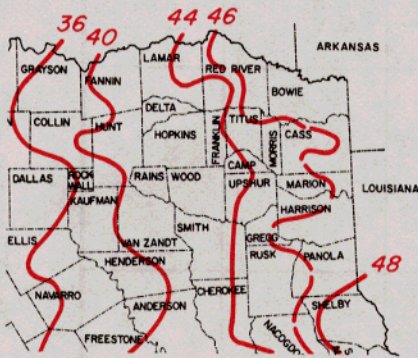
Normal Annual Precipitation (Inches) 1/