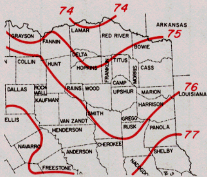
Average Annual High Temperature (F°) 1/