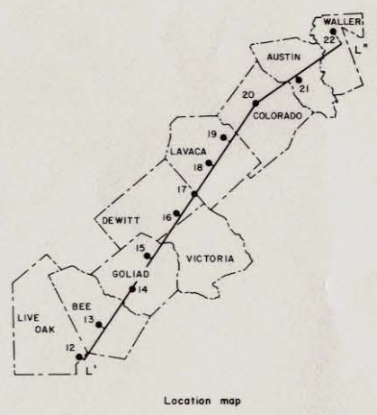
Geologic Section L'-L''