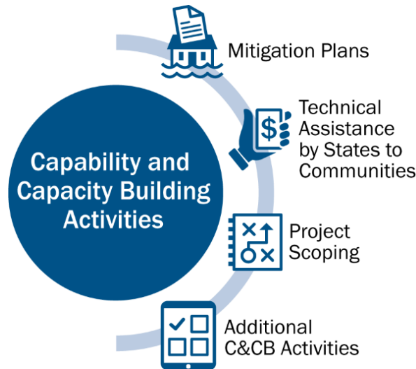
Figure 2: Capability and Capacity Building Activities

FEMA will select up to $60 million in FY 2023 for Capability and Capacity Building Activities to develop future Localized Flood Risk Reduction Projects and/or Individual Flood Mitigation Projects that will subsequently reduce flood claims against the National Flood Insurance Program. FEMA will select the highest scoring eligible subapplication(s) based on the C&CB Activities' Final Priority Scoring Criteria.