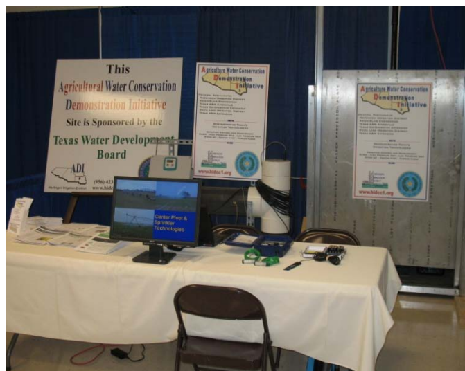
Figure 4 Booth at RGV Irrigation Conference

The ADI staff participated in the Rio Grande Valley Irrigation Conference in October. The conference put on by Texas AgriLife Extension Service gave ADI personnel an opportunity to talk to visitors about water scheduling and soil moisture monitoring as well as showcase the irrigation technologies that are demonstrated through the ADI project.