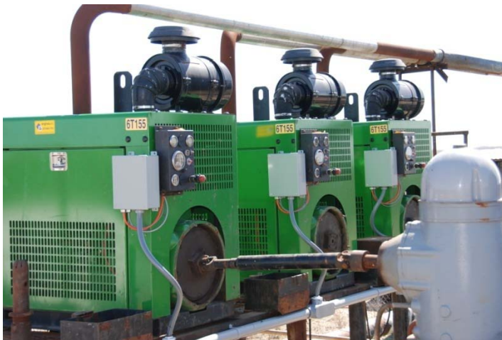
Figure 3 Variable speed controller components installed on the pumps