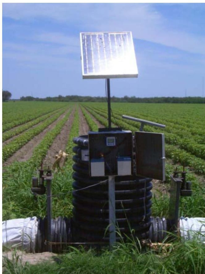
Figure 1 Large surge valve developed by HID

Due to Hurricane Dolly much of the data collected on the sites was compromised. Dolly delivered over sixty inches of rain water at the time of harvest for our sites. Because of this many of our sites will not have complete data. We will continue to monitor these sites through the next growing season.