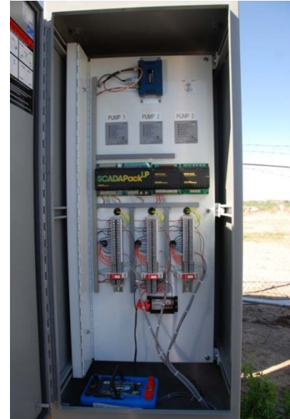
Figure 2 Variable Speed Controller SCADA and Radio Unit

Delta Lake Irrigation District has installed three diesel driven pumps to supply water to a service canal. As part of their revised 2006 contract, Delta Lake Irrigation District will provide the hardware and Harlingen Irrigation District has contracted Axiom-Blair to provide engineering and design for the variable speed and control component of this project. The installation of the variable speed controllers is complete and in the testing phase of the project.